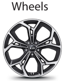
GT Line 19" Alloy Wheel